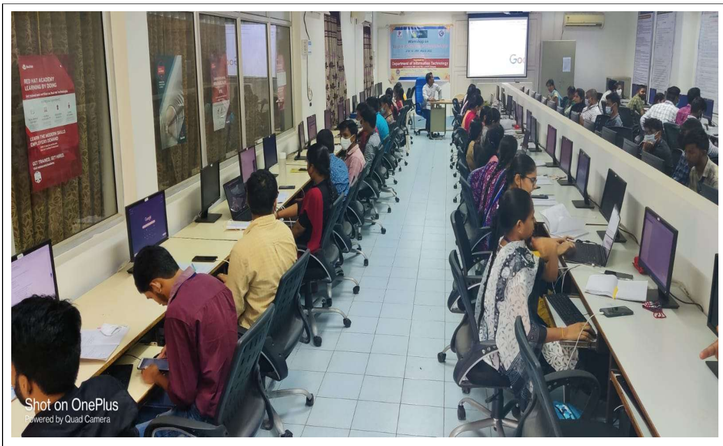
Tech Training sessions